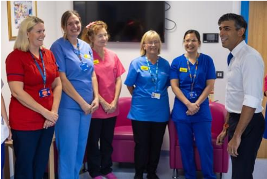
Prime Minister Rishi Sunak with staff on Jubilee Ward at NDDH

He also visited our Coronation Suite discharge hub, which opened in July 2023, and provides a space for patients to wait to go home when they no longer need a hospital bed. The suite, which was built as part of a national package to support hospital discharge, has been a huge success, seeing more patients in its first week of operation than we saw in a month in the previous temporary discharge lounge.