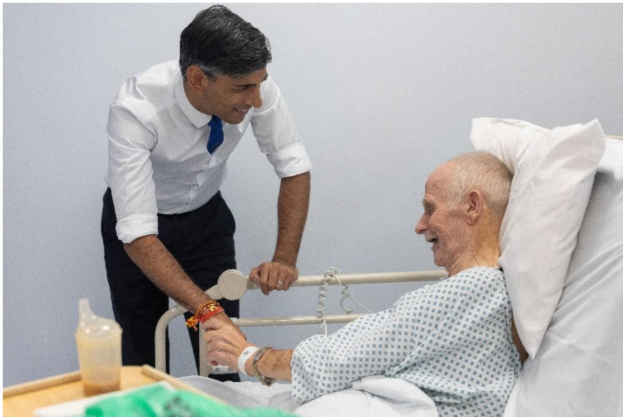
Prime Minister Rishi Sunak with a patient in the Coronation Suite at NDDH

We were delighted to welcome Prime Minister Rishi Sunak to North Devon District Hospital in September to demonstrate how two new facilities are helping us to recover our waiting lists and improve the care we provide to patients.