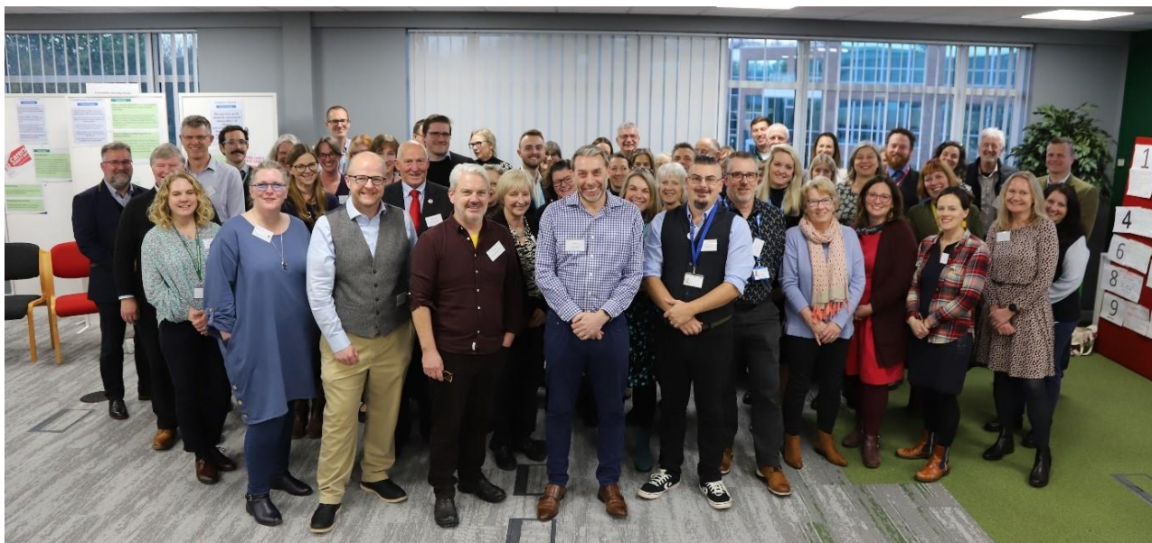
Delegates at the ELCP conference