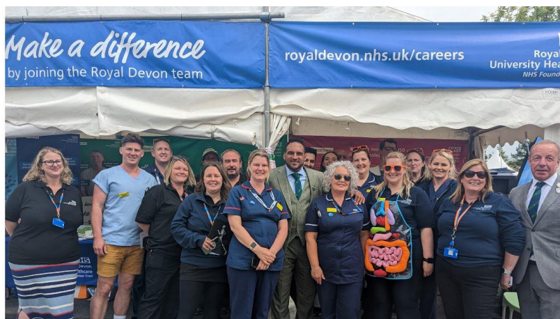
Michelin Star chef Michael Caines with the Royal Devon team

Colleagues from across the Royal Devon inspired visitors to consider a career with us at this year's Devon County Show (18-20 May).