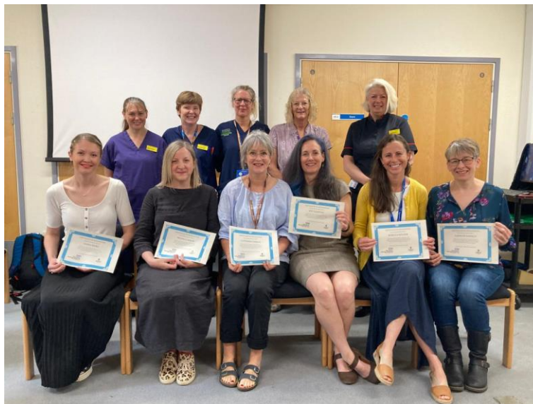
Return to practice graduates

A cohort of nurses and midwives have successfully completed our return to practice programme, and have joined the Royal Devon as fully registered professionals. To celebrate this huge achievement, returnees were invited to attend a commemorative cream tea and presentation ceremony on Friday 19 May at the Centre for Women's Health at the Royal Devon and Exeter (Wonford) Hospital. Following the presentation ceremony, returnees held an open forum where the next cohort were able to ask questions about their experiences.