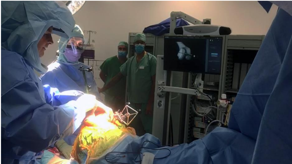
The 1000th hip/knee replacement taking place

The South West Ambulatory Orthopaedic Centre (SWAOC) has hit another major milestone, completing its 1,000th knee/hip replacement since opening at the Nightingale in March 2022.