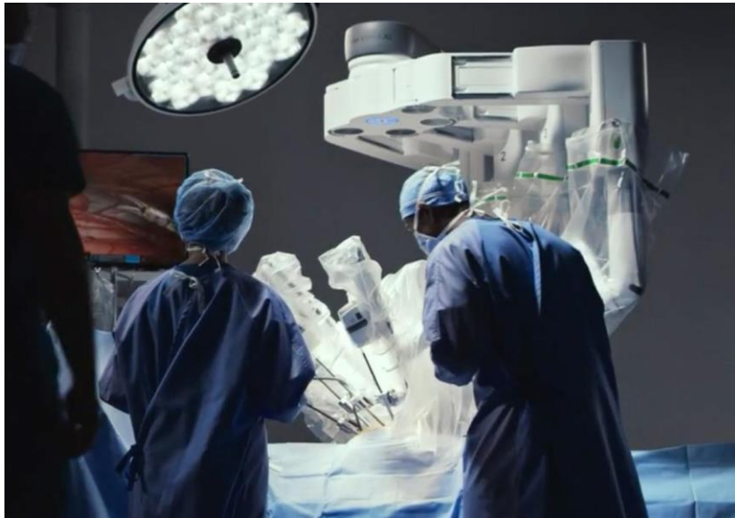
Da Vinci XI robot being used in surgery

The Trust is very pleased to have taken delivery of two new Da Vinci XI robots. This is a second robot for our RD&E (Wonford) hospital to support expanded use in head and neck surgery, as well as urology.