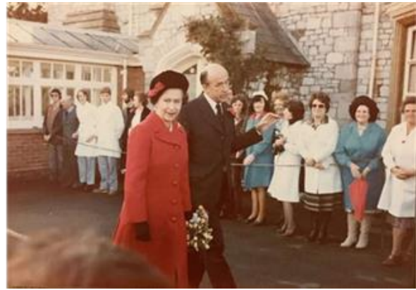
The Queen and Prince Philip visiting the Princess Elizabeth Orthopaedic Centre (PEOC) in Exeter in 1979