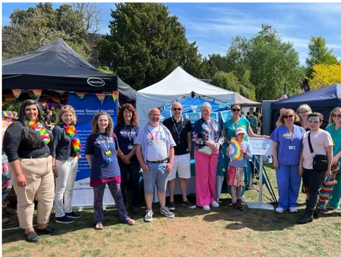
Royal Devon staff showing their support at Exeter Pride

People who weren't able to attend the event can share their thoughts via an online survey , which will be used to shape and improve local services.